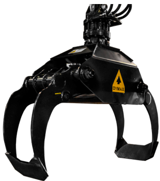
BYPASS GRAPPLES - LOGGING STYLE