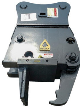
TIE CRANE SLIDE GRAPPLE