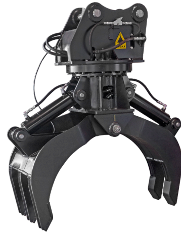
CONSTRUCTION AND DEMO GRAPPLE