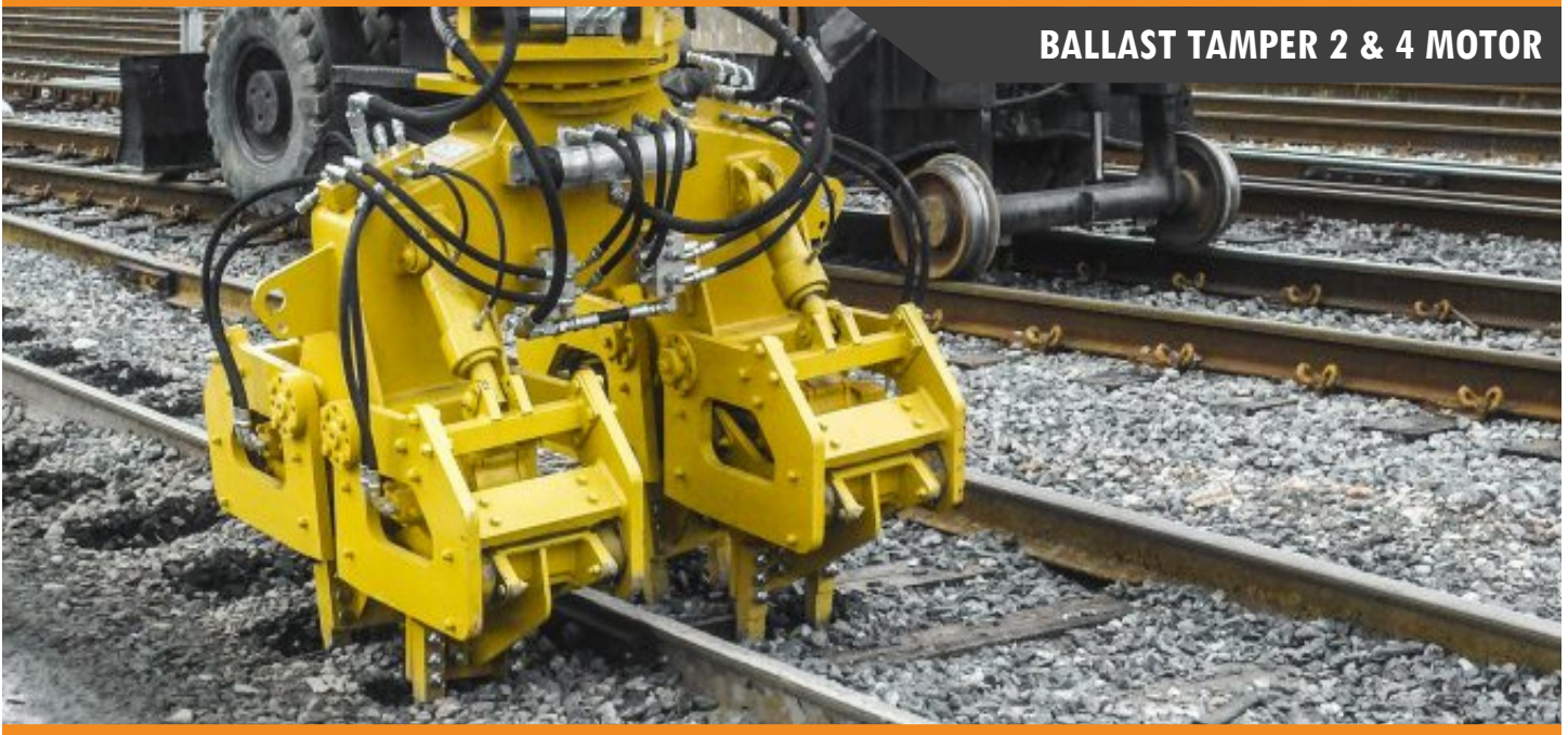
BALLAST TAMPER 2 & 4 MOTOR